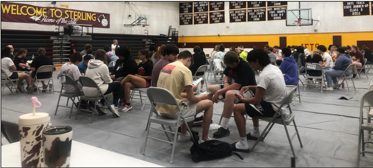
SENCA came to Sterling High School to talk about poverty and the students participated in a real life simulation.